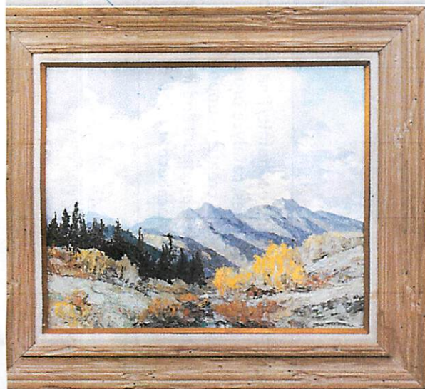
Cabin in the Hills, Wyoming.